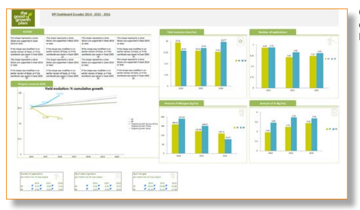
Country report dashboard for Ecuador, 2016

Good Growth Plan cocoa farmer, Ivory Coast